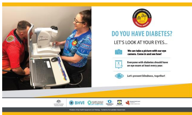
Example of hanging banner (also available in dark colours for outdoor use)

To help encourage patients at your clinic to get a retinal photograph taken, you can order a pull up or hanging banner which is free of charge to your clinic and fully funded by the project. All banners are personalised to include your health service logo and a photo of your staff using the camera.